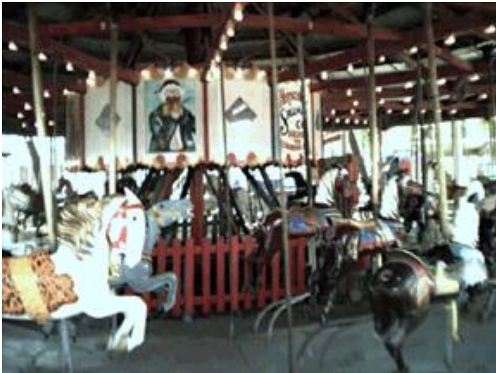
Merry – Go – Round