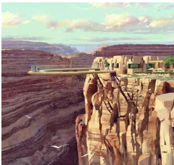
Proposed Sky Walk at Bhaley Dunga in line with the Sky-Walk of Grand Canyon, U.S.

Therefore, keeping in view the project requirements, the Thirteenth Finance Commission is requested to provide a grant of Rs. 200.00 crore.