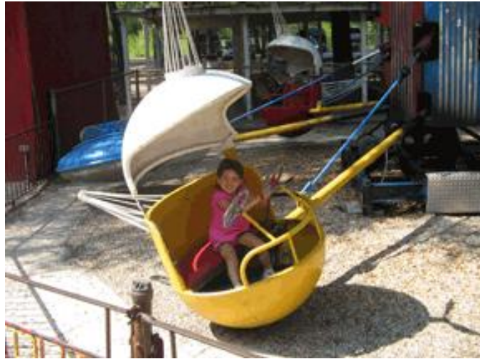
Helicopter and Flying Saucer ride