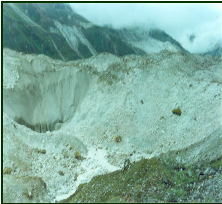
Condition of Zemu Glacier outlet in 2004