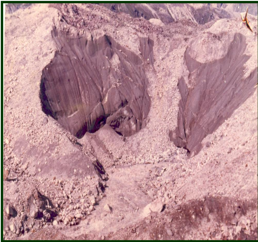
Condition of Zemu Glacier outlet in 1982